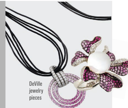
DeVile jewelry pieces

The Hilton ballroom becomes Monte Carlo for Seven Acres care center's fabulous affair, featuring live music, dancing, cocktails, a live auction and casino games. Jan. 29, 7PM. Hilton - Post Oak, 713.778.5781, sevenacres.org